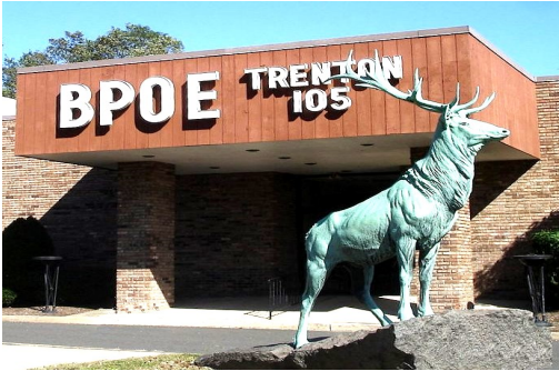
42 DeCou Avenue, West Trenton, NJ 08628-2907

NON-PROFIT MAIL US POSTAGE -PAID- Trenton, NJ Permit #674